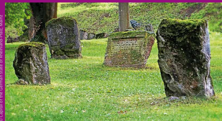
© Capital of the German state of Rheinland-Pfalz, Mainz